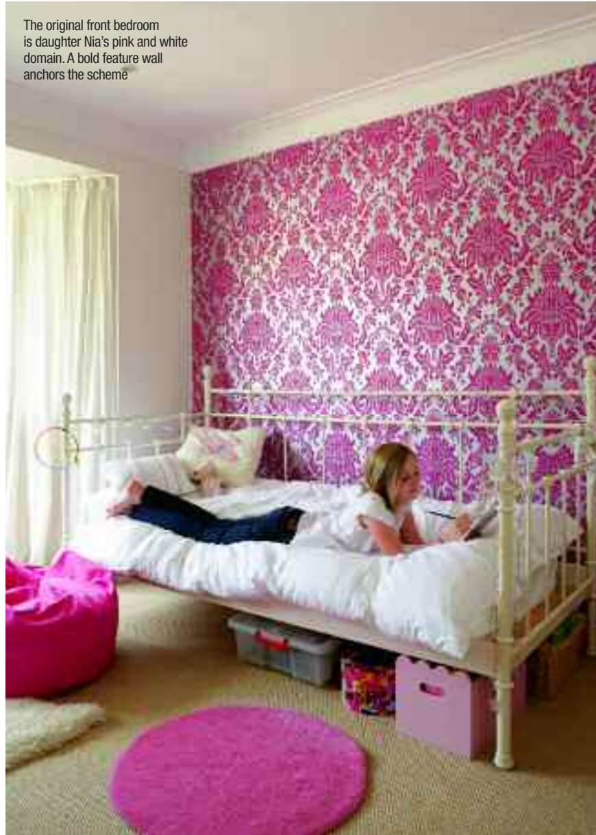
The original front bedroom is daughter Nia's pink and white domain. A bold feature wall anchors the scheme