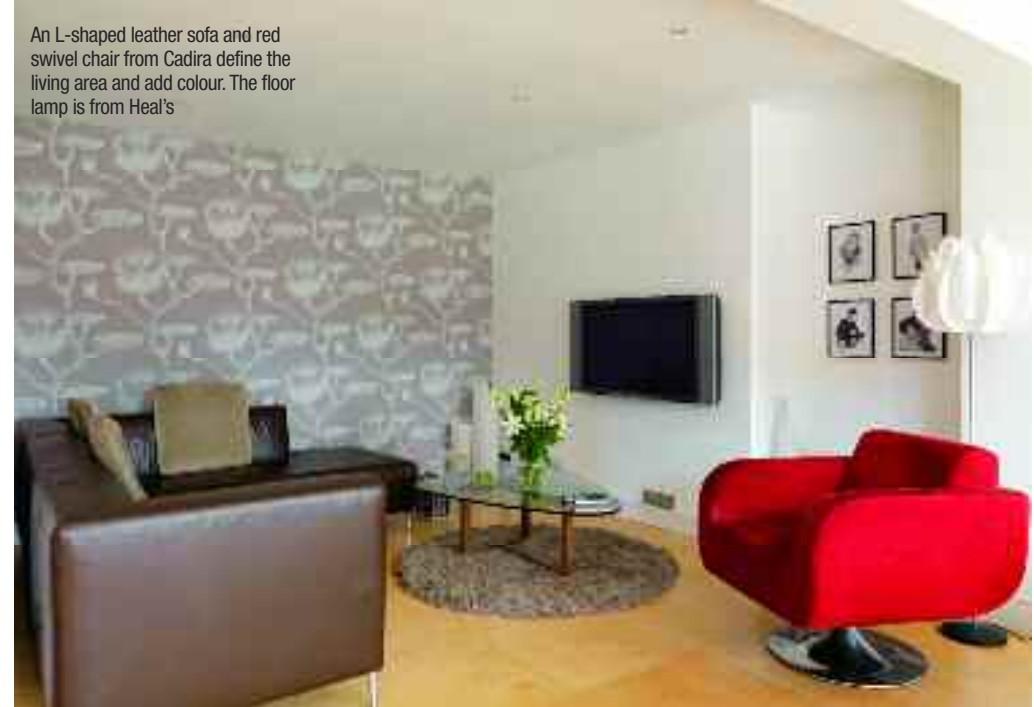
An L-shaped leather sofa and red swivel chair from Cadira define the living area and add colour. The floor lamp is from Heal's

'At first I thought we could all carry on living here and even started to buy camping equipment for us to use when the work ▶