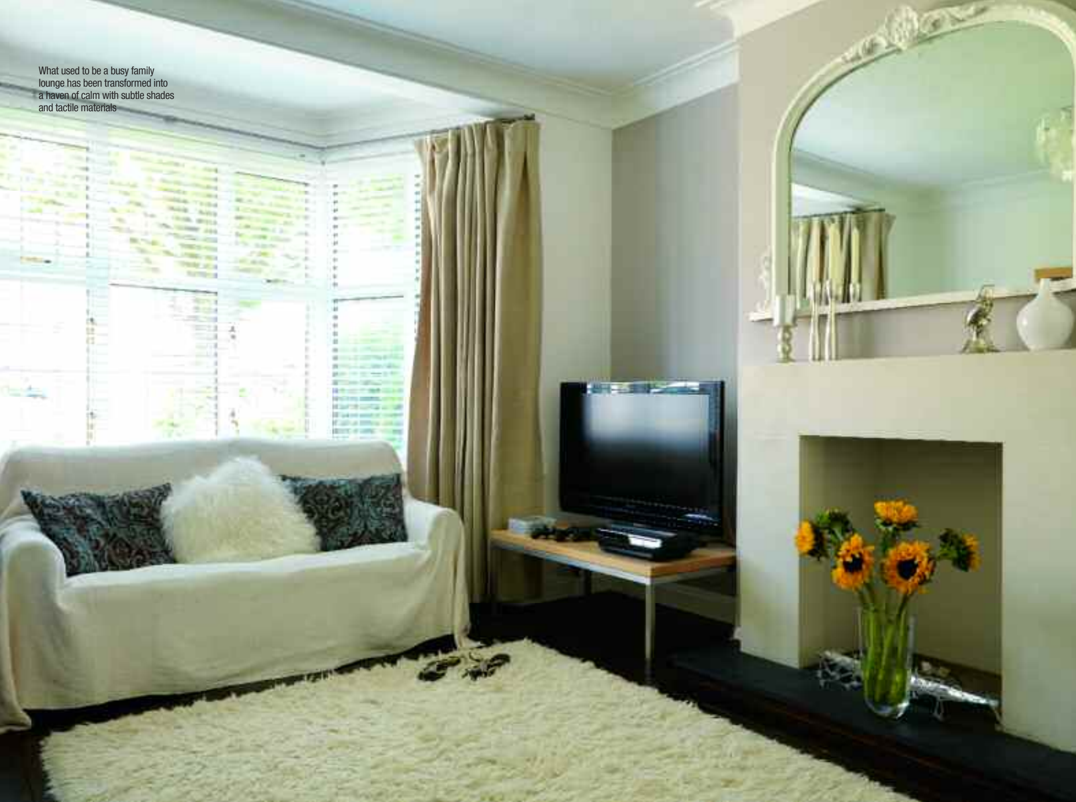
What used to be a busy family lounge has been transformed into a haven of calm with subtle shades and tactile materials