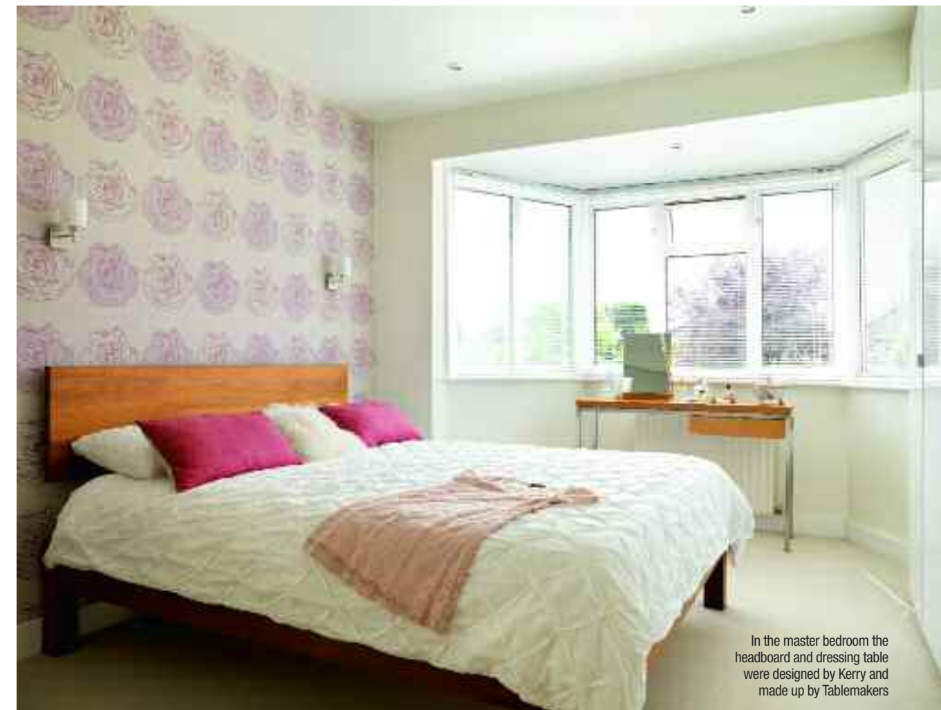
In the master bedroom the headboard and dressing table were designed by Kerry and made up by Tablemakers

started,' says Kerry. 'Clearly I was crazy because it was obvious that it would be impossible for us to stay in a house with no mains water and all the dirt and disruption – as well as being totally unsafe for the children. So we ended up having to move out and rent a flat in the local area for the duration of the build.'