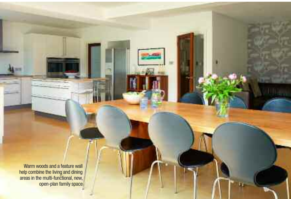
Warm woods and a feature wall help combine the living and dining areas in the multi-functional, new, open-plan family space