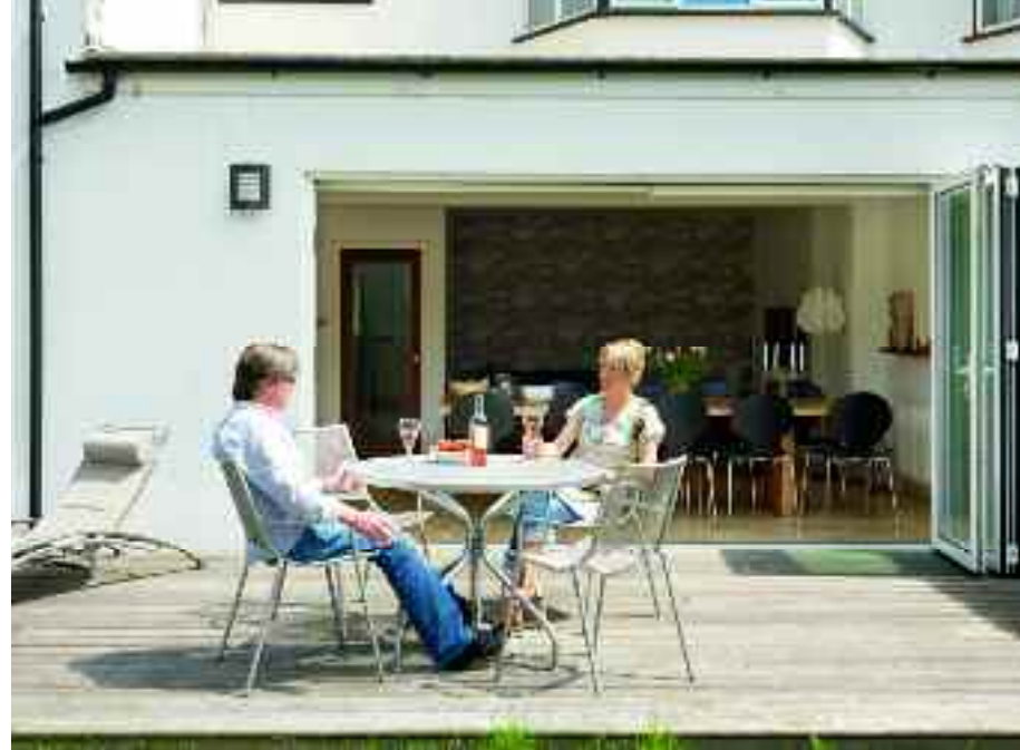
▶ A single-storey, flat-roof extension in rendered blockwork forms the new dining area and doubles the entertaining space by opening directly onto the decking