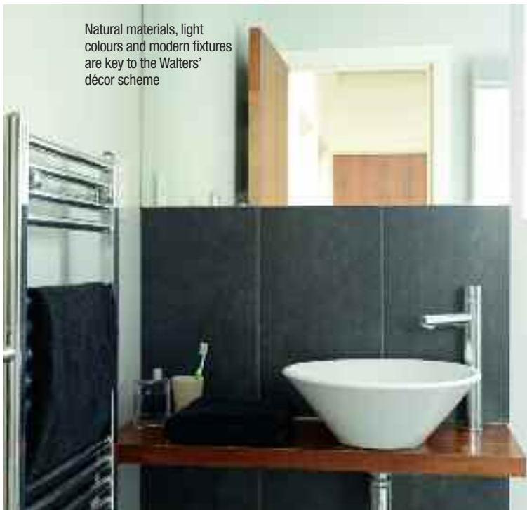
Natural materials, light colours and modern fixtures are key to the Walters' décor scheme

Not only that but Kerry – who has a background in industrial product design – was also responsible for designing numerous items of furniture in the newly remodelled house, including the 12-seater walnut dining table, the games console table and the mirror in the hallway, as well as customised furniture for the bathrooms.