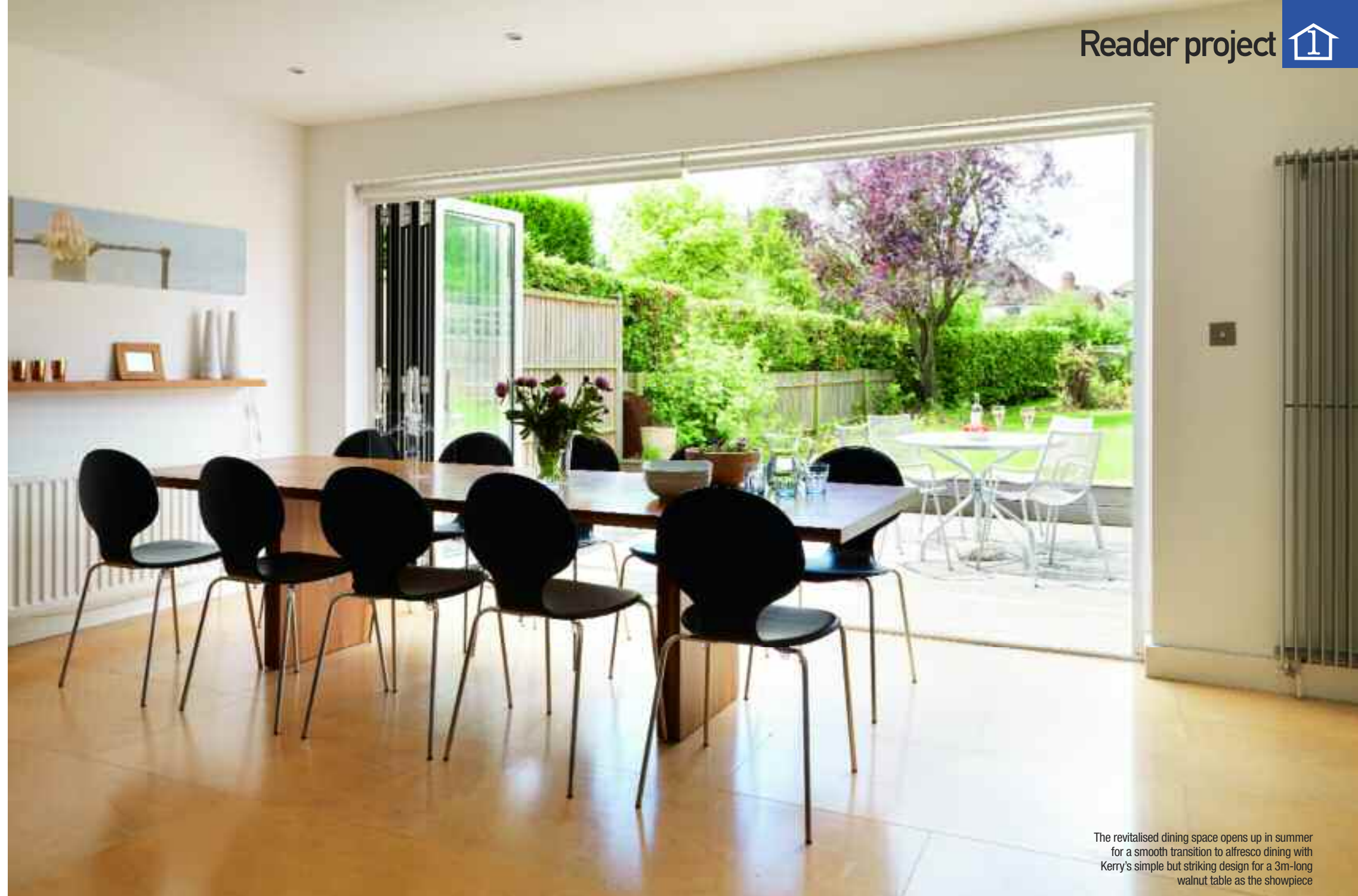
The revitalised dining space opens up in summer for a smooth transition to alfresco dining with Kerry's simple but striking design for a 3m-long walnut table as the showpiece

When the Walters moved into their 1930s semi seven years ago, it was with a view to extending. Like many young families, they were on a tight budget for the first few years with few luxuries. But with a great deal of preparation and hard work, they've managed to remodel their three-bed property into a five-bedroom home that incorporates something for every member of the family.